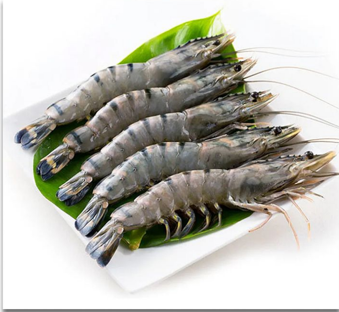
Head On Shrimp