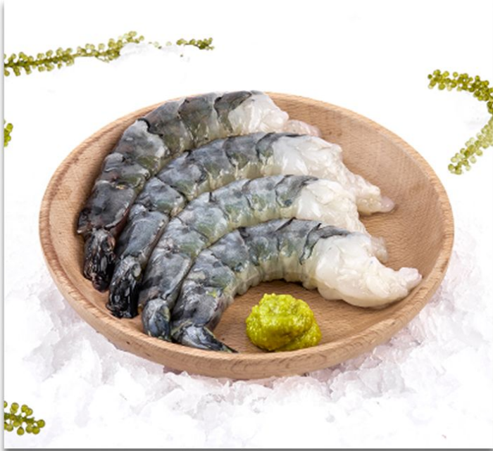
Peeled & Deveined Tail-Off (PD)