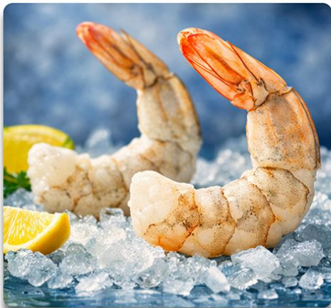
Peeled & Deveined Tail-On Shrimp