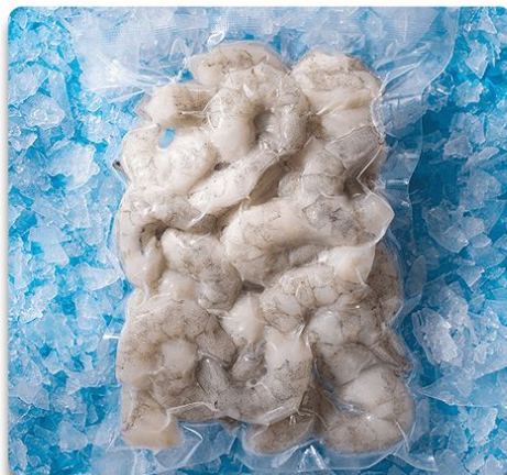
Vacuum Pack Shrimp