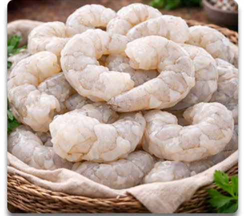
Peeled & Deveined Tail-Off Shrimp