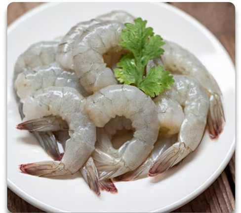
Pin Deveined Shrimp