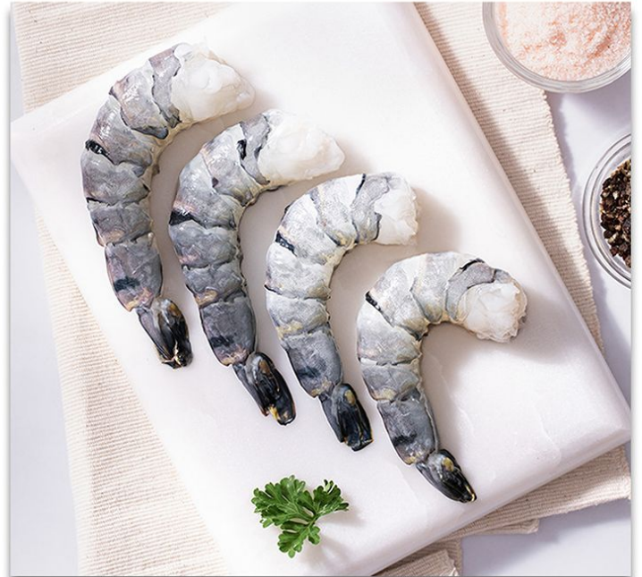
Peeled & Deveined Tail-On (PDTO)