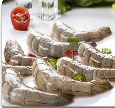
Head Less Easy Peel Shrimp