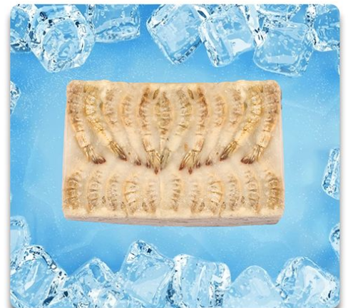
HLSO 4LB Block Frozen