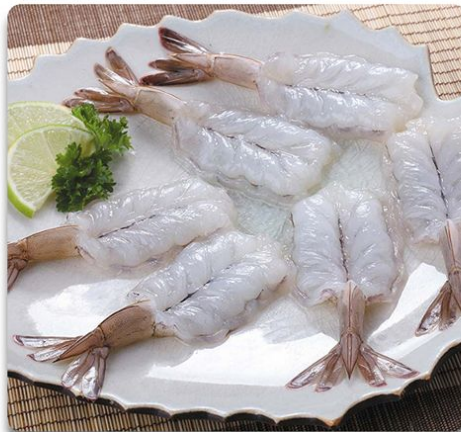
Butterfly 90% Shrimp