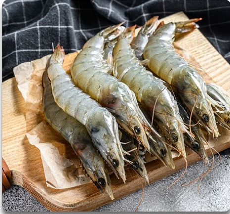
Head On Shrimp